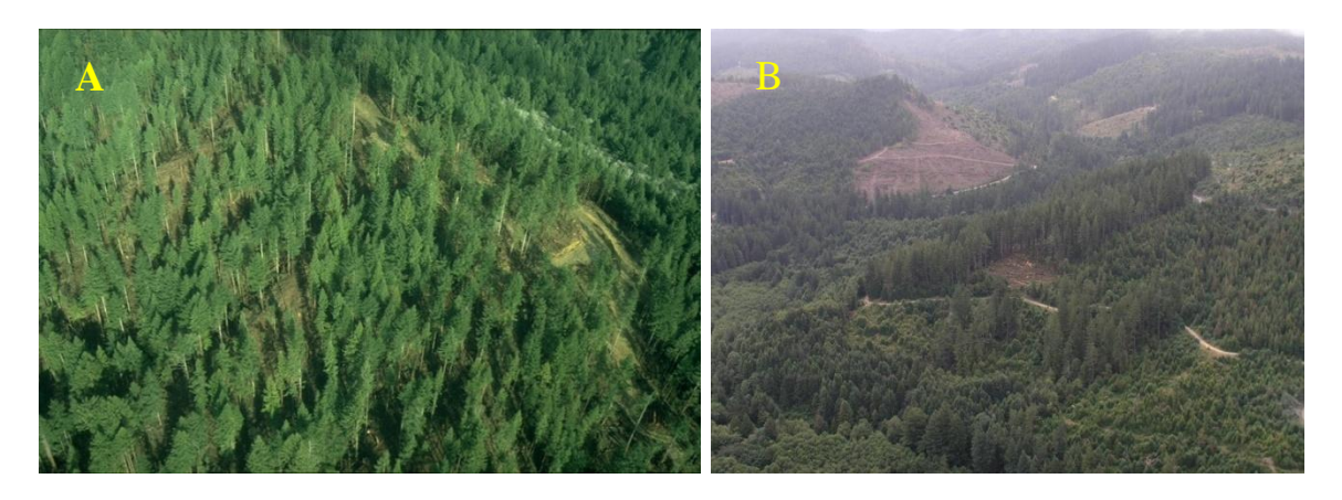
Figure 3. Picture of a selection harvest (A) in a second growth redwood forest near Humboldt Bay and a mosaic of even-aged harvest units (B) in the Little River watershed.

At the landscape level, we believe Green Diamond's application of even-aged silviculture actually provides for greater habitat and structural diversity than application of an uneven-aged silvicultural prescription such as individual tree selection. The two pictures below of recent timber harvesting illustrate this point. The picture on the left (Figure 3.A) is of an "uneven-aged" selection harvest, which if applied extensively across the landscape would result in within stand diversity, but very little stand diversity at the landscape level. This same landscape would be perpetuated indefinitely with repeated entries at intervals of approximately 10-15 years. In contrast, the "even-aged" harvesting on the right (Figure 3.B) may result in little diversity in tree ages at a small scale (<10-20 acres), but at the landscape level, the small clearcuts, riparian reserves and retention of tree clumps within harvest units will provide for much greater overall diversity.