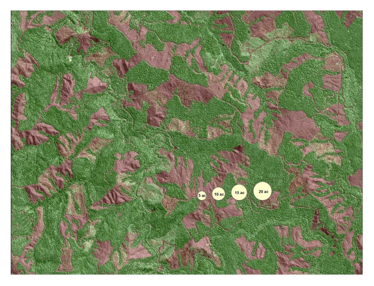
Figure 4. LiDAR imagery of the vegetation layer in the Maple Creek watershed. Extensive even-age timber harvesting was initiated in this area in 1999 and it is currently the sub-basin within Green Diamond's ownership with the highest rate of harvest.

how this silvicultural management will look in the future at the end of a typical rotation within a given sub-basin. The picture of even-aged silviculture (Figure 3.B) may give the impression that the future landscape will be dominated by young seral stages. However, the future managed landscapes created on Green Diamond's ownerships can be predicted by areas of current focused harvesting (Figure 4). At the initiation of the next rotation in approximately 30 years, this sub-basin will be covered by stands regenerated from former harvest units that will be mostly 30-50 years old. Within these stands will be a complex matrix of extensive riparian areas and retention areas (approximately 25%) that will be 80-100 years old. At that point in the future, this particular sub-basins across the ownership will be in the active harvesting stage as pictured below(Figure 4). This process will be repeated across time and space with harvest units continuing to be harvested at the appropriate site-specific rotation age, but the riparian and retention areas will continue to age relative to the harvest units.